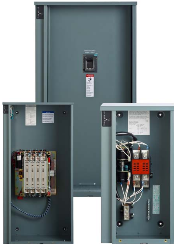
Covers have been removed for illustration.